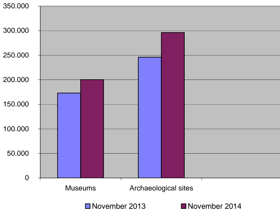
SURVEY ON MUSEUMS AND ARCHAEOLOGICAL SITES NOVEMBER 2014

The number of visitors at archaeological sites, during the eleven-months of 2014 recorded an increase of 21,6% and the corresponding receipts rose by 13,1%, in comparison with the corresponding period of 2013 (Table 2).