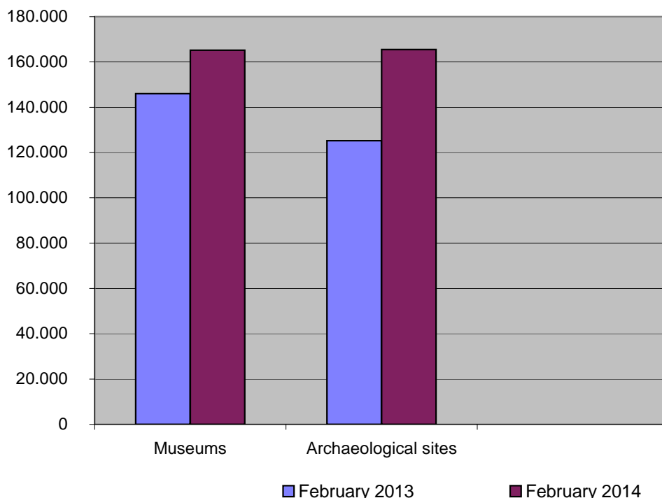
SURVEY ON MUSEUMS AND ARCHAEOLOGICAL SITES FEBRUARY 2014

The number of visitors at archaeological sites, during the two-months of 2014 recorded an increase of 30,7% and the corresponding receipts rose by 24,3%, in comparison with the corresponding period of 2013 (Table 2).