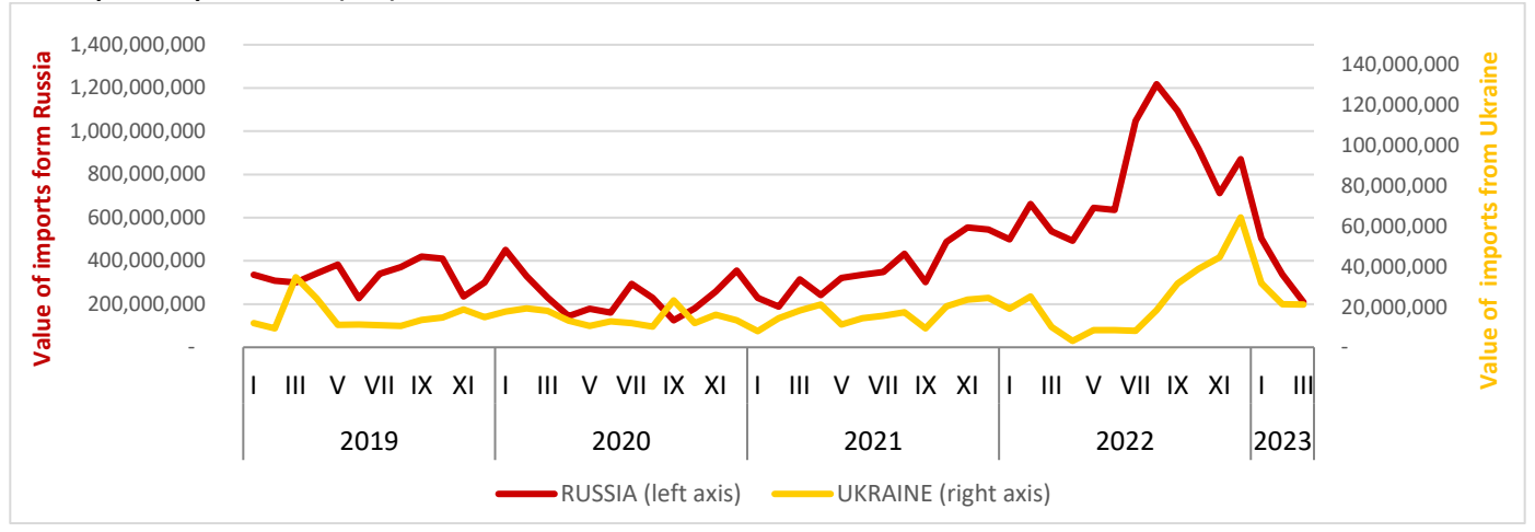
Graph 1: Imports value (in €) Greece-Russia and Greece-Ukraine

The current Publication is issued on a monthly basis at preannounced dates during the whole period in which the publication of bilateral trade data is warranted and relevant in order to reflect the impact on the external trade transactions of the Greek enterprises with enterprises in Russia and in Ukraine.