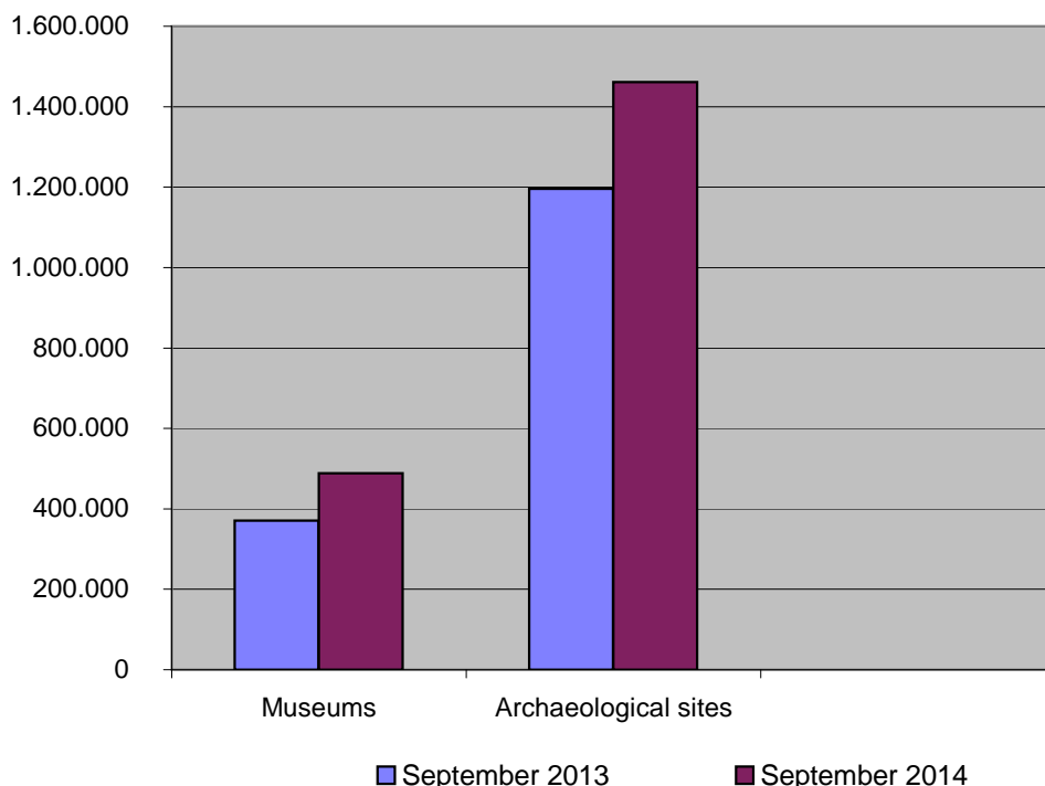
SURVEY ON MUSEUMS AND ARCHAEOLOGICAL SITES SEPTEMBER 2014

The number of visitors at archaeological sites, during the nine-months of 2014 recorded an increase of 21,7% and the corresponding receipts rose by 14,2%, in comparison with the corresponding period of 2013 (Table 2).