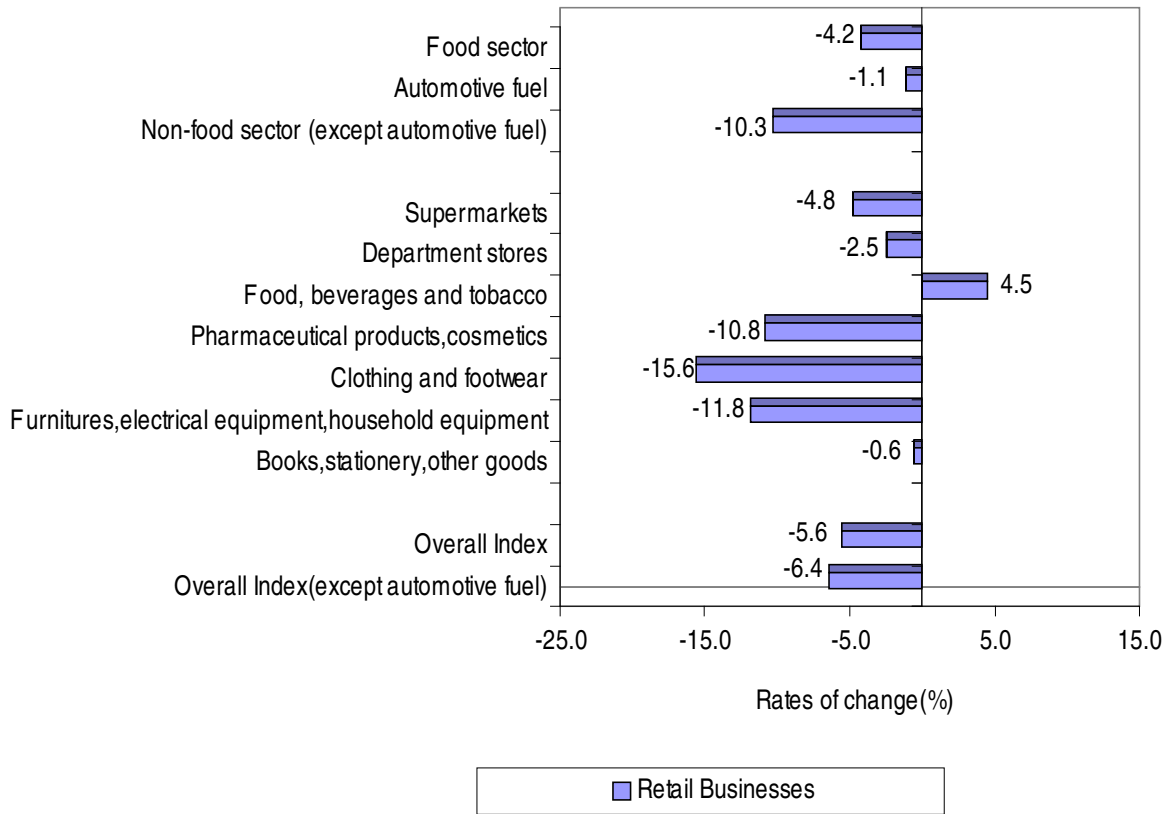
Graph 2. Monthly rates of change (%) of the volume index in retail trade , between March 2013 and February 2013.