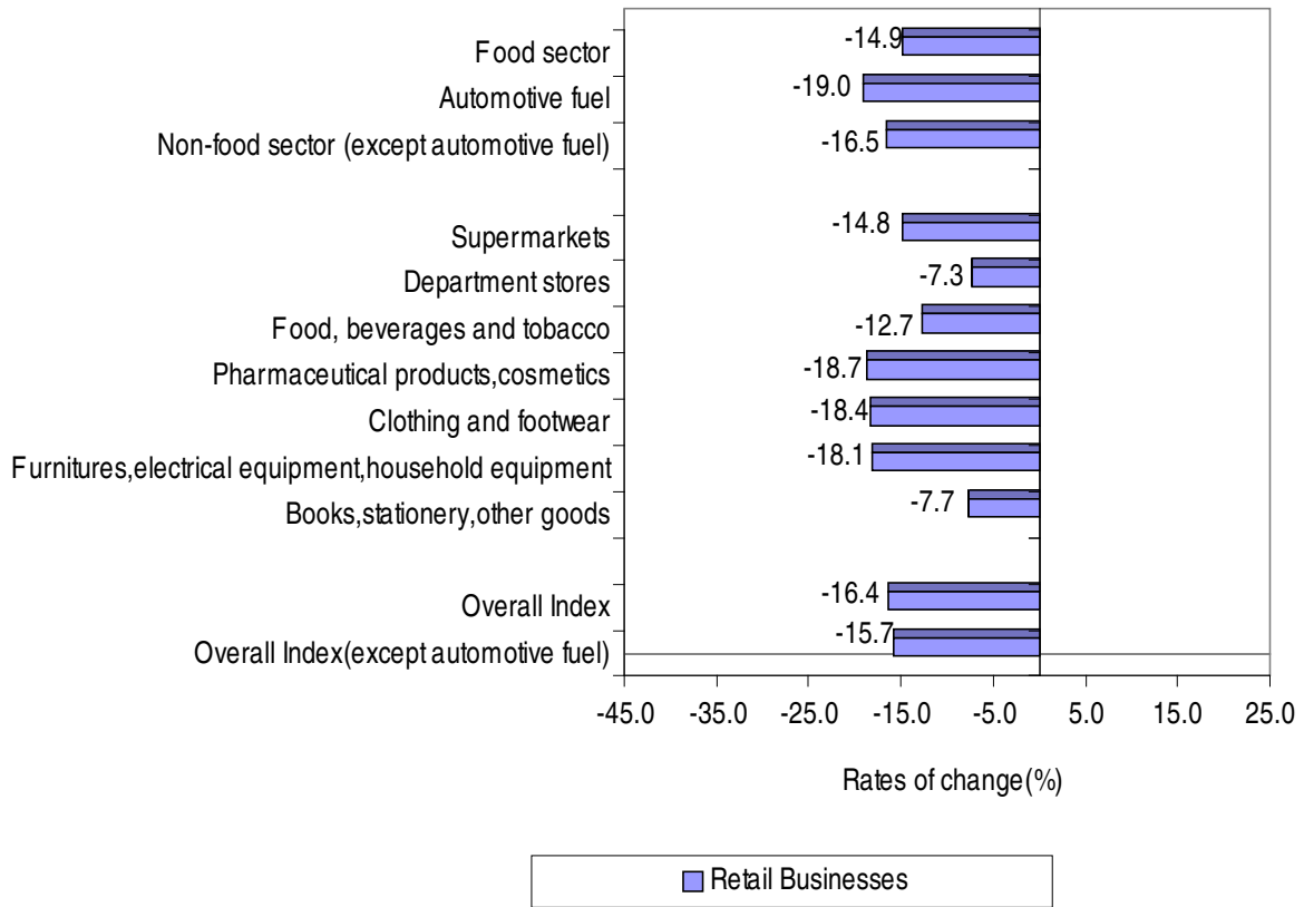
Graph 2. Monthly rates of change (%) of the volume index in retail trade , between January 2013 and December 2012.