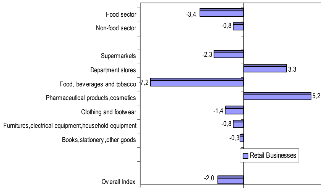
Annual rates of change (%) of the volume index in retail trade , between July 2008 and July 2007.