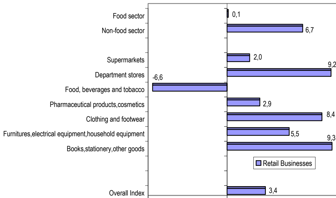
Annual rates of change (%) of the volume index in retail trade , between January 2008 and January 2007.