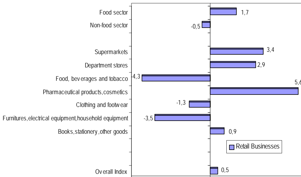
Annual rates of change (%) of the volume index in retail trade , between September 2007 and September 2006.