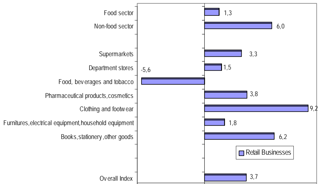
Annual rates of change (%) of the volume index in retail trade , between August 2007 and August 2006.