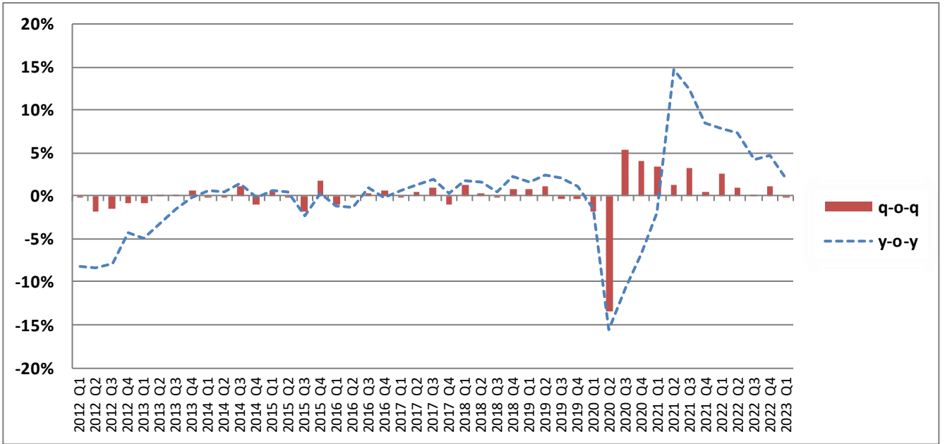
Graph 2: Gross Domestic Product (GDP) in Volume Terms (Reference Year: 2015) WITH and WITHOUT Seasonal Adjustment 2012-2023