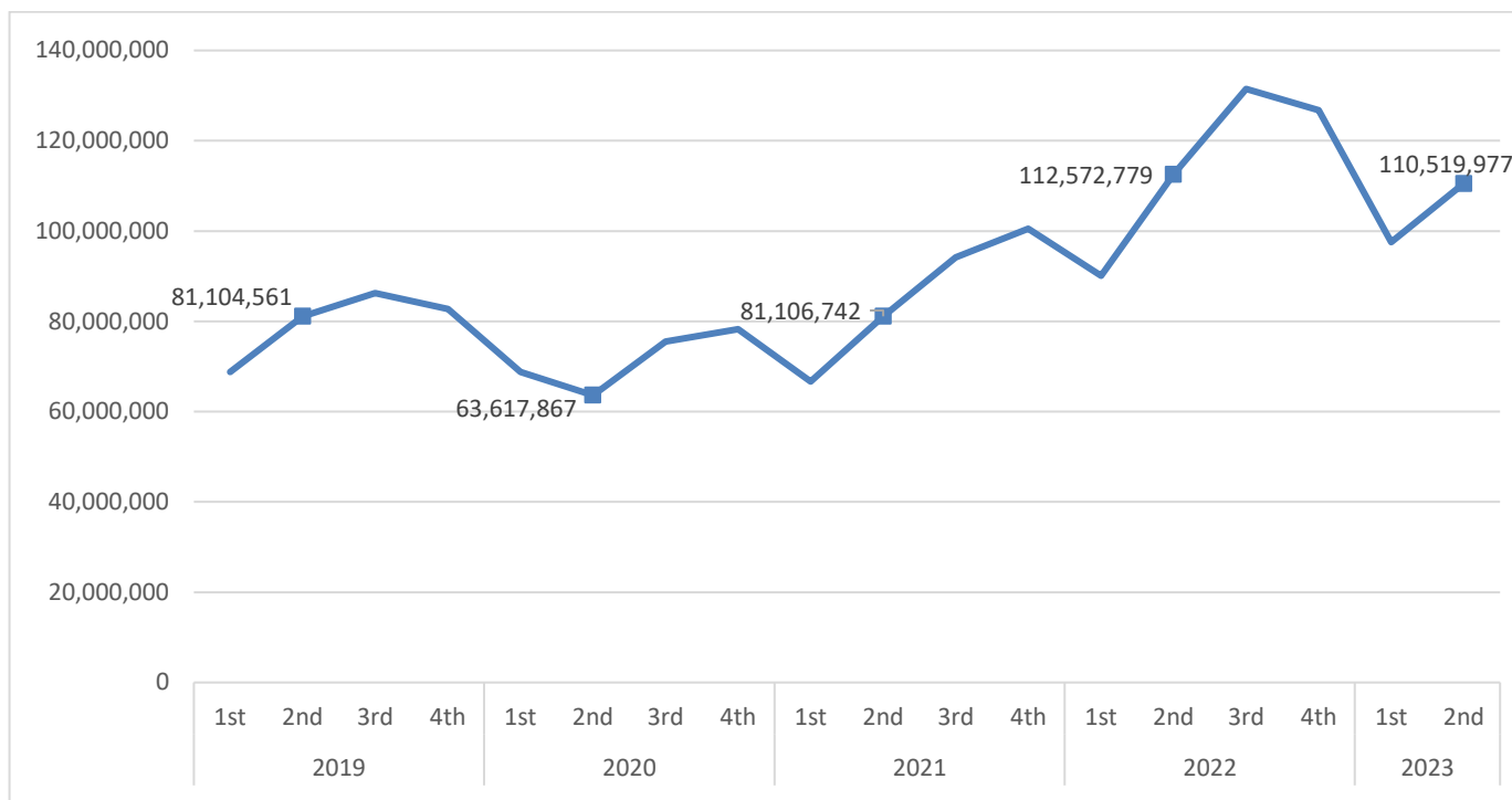
Graph 2. Turnover (in thousand €) only for the Enterprises obliged to double-entry accounting bookkeeping (monthly data submission)