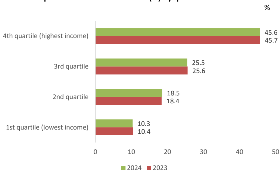
Graph 2. Distribution of income (%) by quartiles: 2023 – 2024

Another common way of measuring income inequality is by quintiles (the share of the national income held by each of the five (equal) parts of the population). In other words, by sorting the population in ascending order according to their equivalised disposable income (lower to higher income) and then by dividing the population into five equal parts (based on the total number of persons), we get the following results (Graph 3, Table 3):