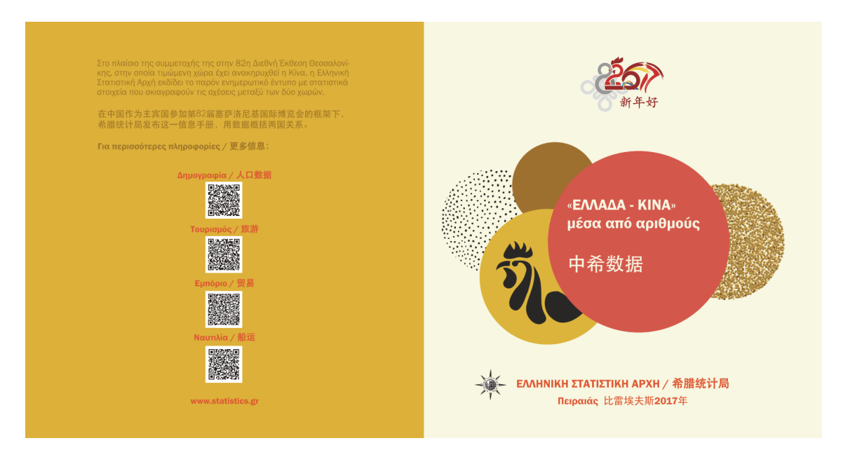
Image: The first page of the publication "GREECE - CHINA in figures".

In the framework of its participation in the 82nd TIF, in which China was proclaimed as the honoured country, ELSTAT issued, for the first time, an information leaflet entitled "GREECE – CHINA in figures". This bilingual publication (in Greek and Chinese) contains statistics that outline the relations between the two (2) countries and is available at the following link: http://www.statistics.gr/documents/20181/5346500/elstat_greece_china.pdf/3d4d8f69-a87d-4b9f-a082-bf4fb9ca4c22.