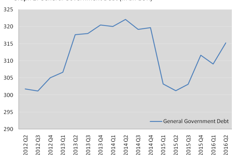
Graph 2: General Government Debt (in bn EUR)