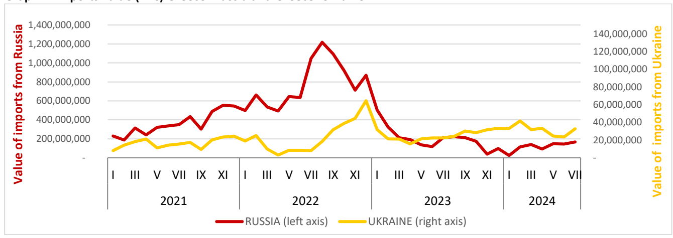
Graph 1: Imports value (in €) Greece-Russia and Greece-Ukraine

The current Publication is issued on a monthly basis at preannounced dates during the whole period in which the publication of bilateral trade data is warranted and relevant in order to reflect the impact on the external trade transactions of the Greek enterprises with enterprises in Russia and in Ukraine.